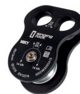
PULLEY MIKY (RK806BB00) strength 28 kN for ropes Ø max. 13 mm weight 105 g EN 12278