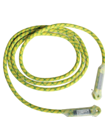
PATRON LANYARD (W2113) length 3.5 m / 5.5 m Ø 11 mm weight 345 g / 540 g EN 795B